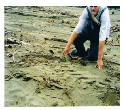
Top of fence post.

The 2004 flood saw 60 ha flooded but 12 ha of this area in particular was left with 0.5 to 1 m of a sandy and rubble deposit (see photo below).