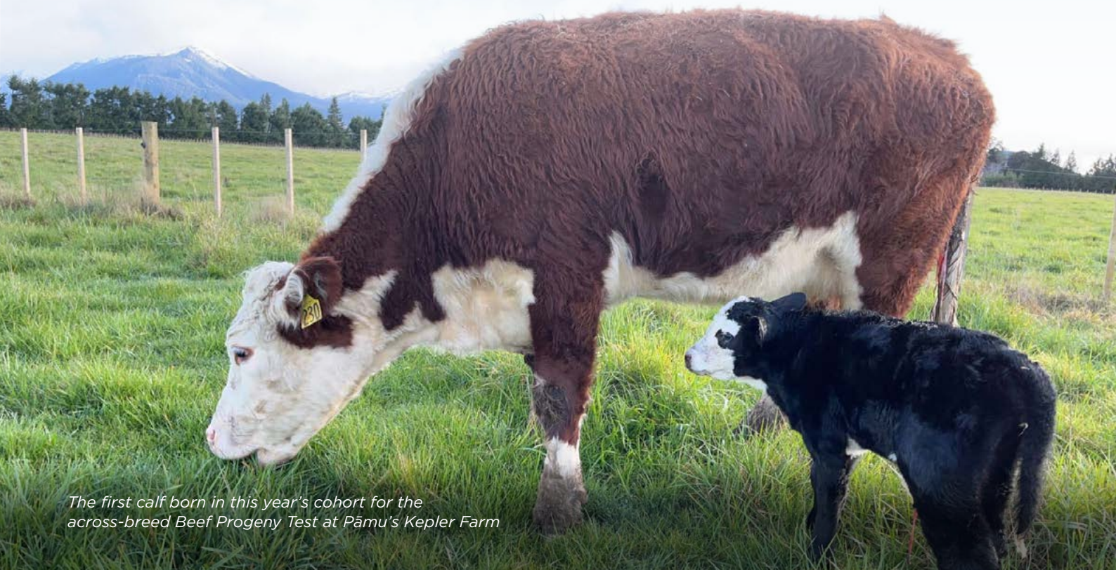
The first calf born in this year's cohort for the across-breed Beef Progeny Test at Pāmu's Kepler Farm

We also acknowledge all the farmers who have provided access to their farms for studies, samples for testing, and shared their knowledge and expertise.