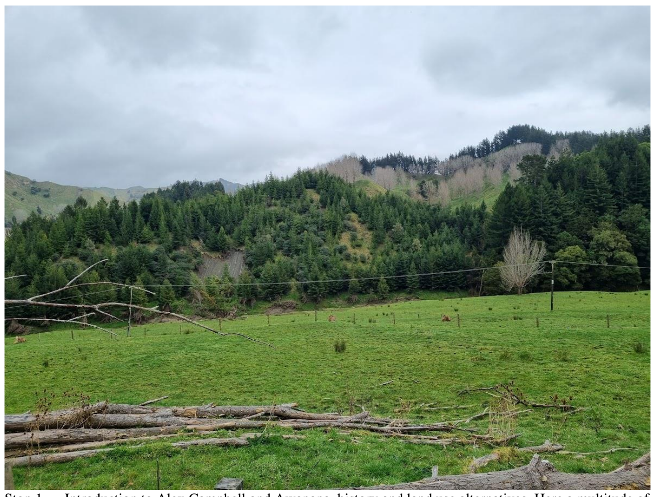
Stop 1. Introduction to Alex Campbell and Awapapa, history and land use alternatives. Here a multitude of species can be seen. Cedar, redwoods and blackwoods. Alex would allow for clearfelling in the future as the roots will hold the soil.

Chairperson Tree Growers Tairāwhiti, the Gisb/East Coast Branch of NZFFA