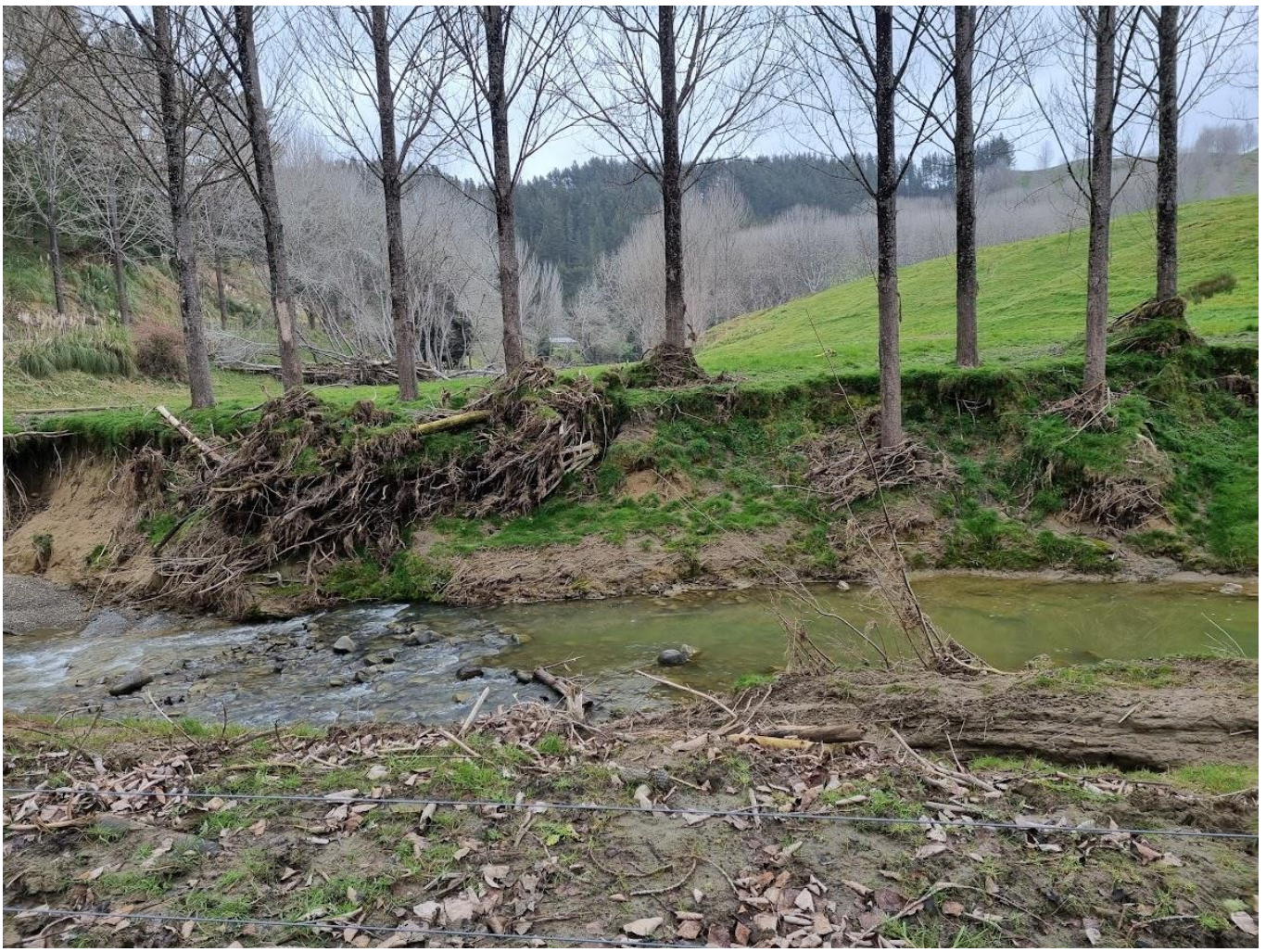
Stop 3. The poplars were the slash catchers.... 10km of fencing along the river. How to fence waterways??? How to fence moving lands? 1000 poplar poles planted most years. No sleeves, halving the costs.