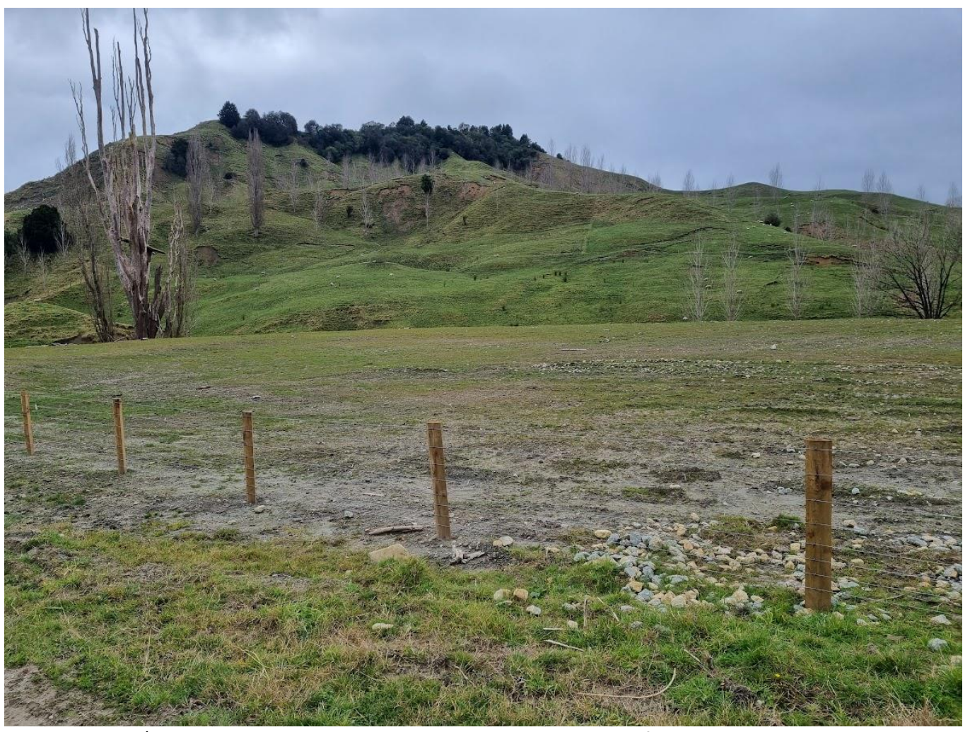
Stop 4. 1.6 slips/ha on poplar planted Awapapa and 3.6 slips on un planted farm land on neighbouring Dumgoyne. What are the benefits of planting poplar?