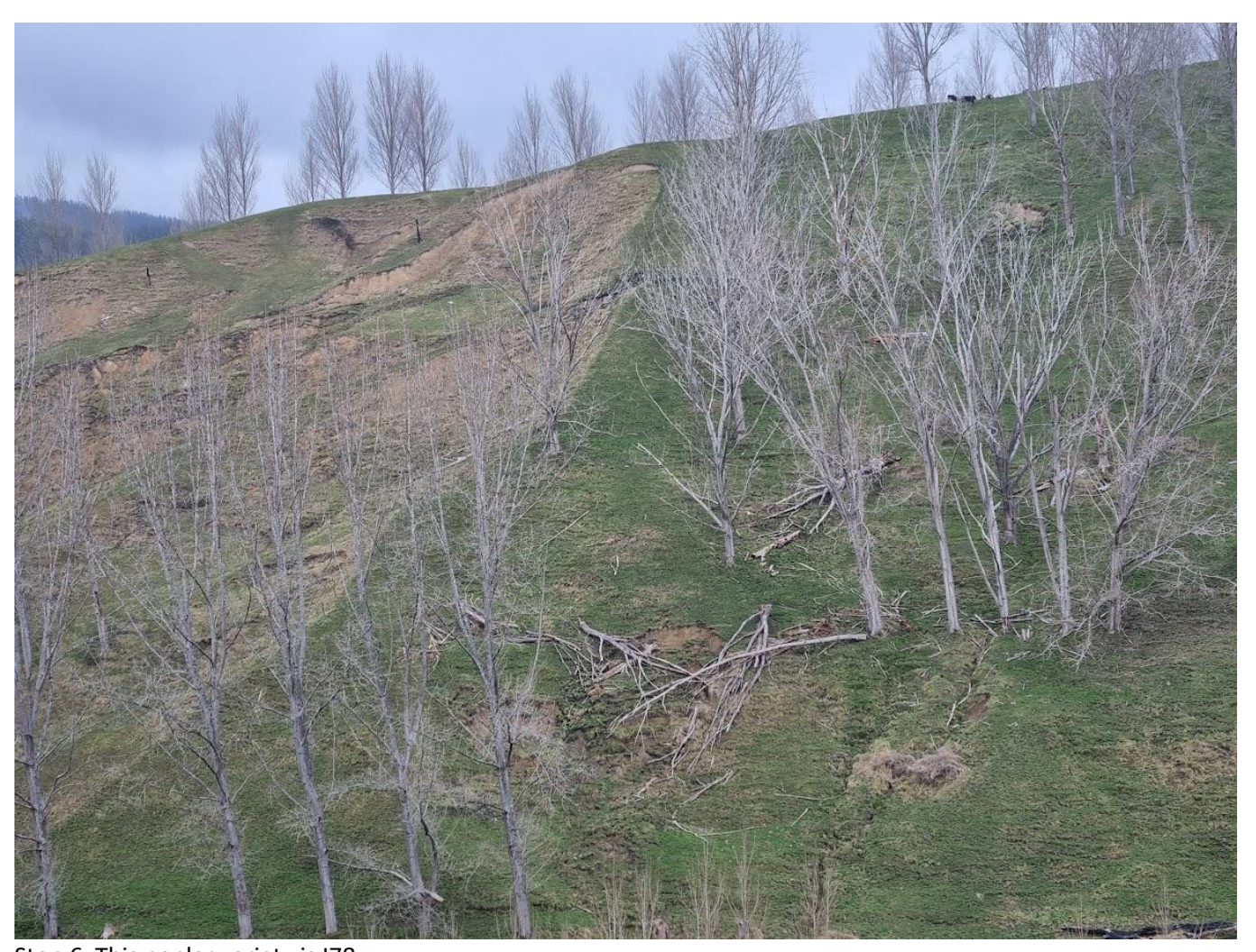
Stop 6 This poplar variety is 178.

The land to the left had been previously cultivated and sustained severe slips during Cyclone Gabrielle. Some farm consultants maintain loss of grass growth due to poplars.