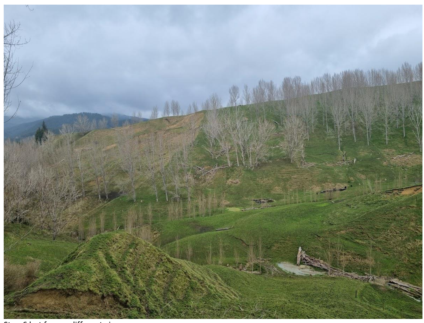
Stop 6 but from a different view