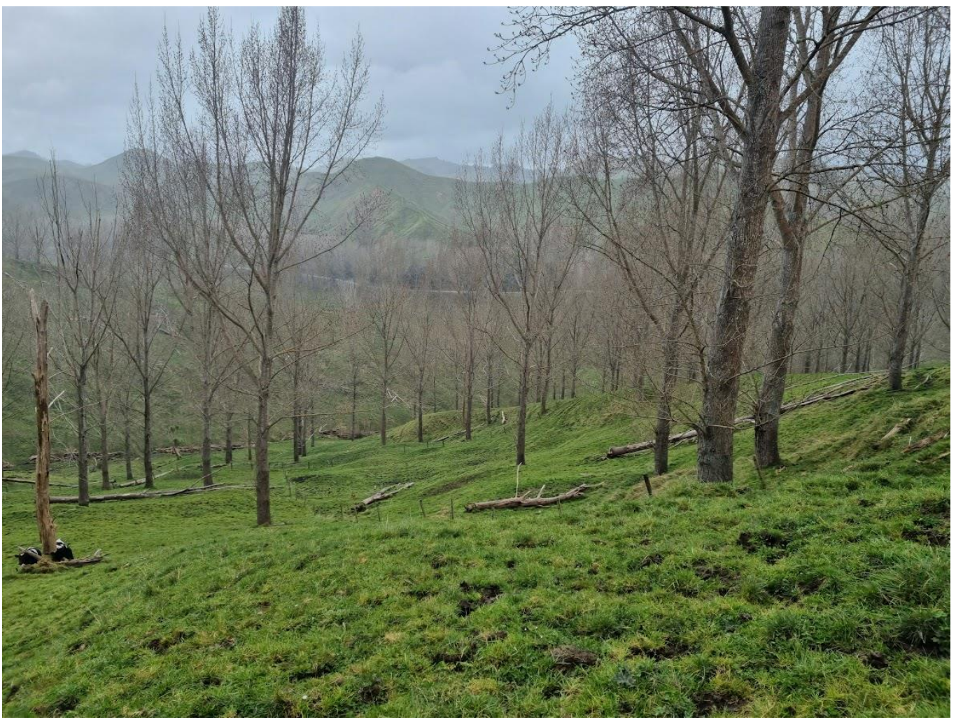
Stop 7. Lunch spot, a 10 minute walk with further discussion. Poplars in a commercial farming operation .

Rain, hail or sunshine: the field day will go ahead. Wednesday 20<sup>th</sup> of Sept 09.00 start at Awapapa, Tiniroto Rd.