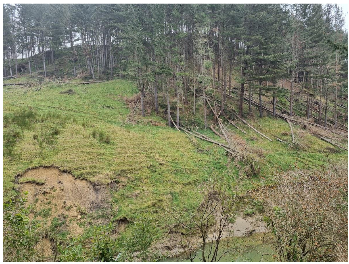
Stop 2. Collapsing radiata stand. What are the practical landuse options here ??? Discuss melanoxylon, deodar, macrocaroa and or robinia.