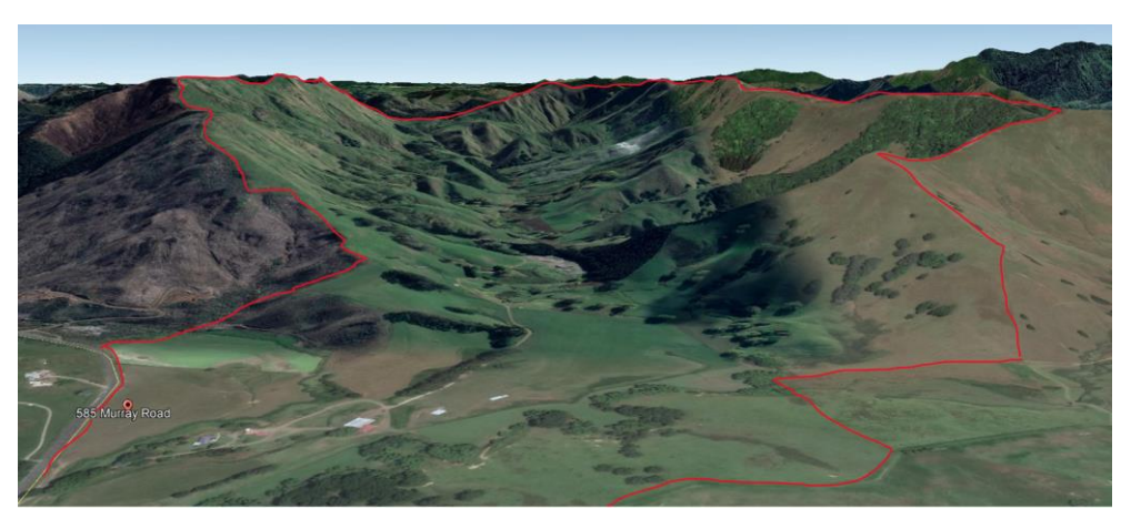
Ashgrove property boundary in red

Ashgrove is a 478 ha sheep and beef farm with 415 ha's effective, 75% is steep class 6 and 7 hard hill country. Located in Tangowahine Valley, North of Dargaville it typically receives 1600mm of rain per year. The farm has a semi volcanic soil type that is free draining but prone to drying out quickly when insufficient rain. The stock policy is sheep breeding and finishing complemented with bulls and steers in a ratio of 55% sheep and 45% cattle.