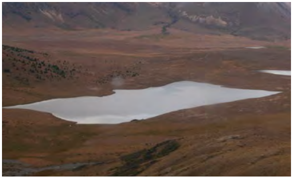
Lakes, tarns, ponds and dams – body of freshwater entirely or nearly surrounded by land.