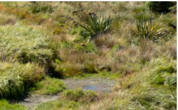
Wetland – Permanently or intermittently wet areas, shallow water, and land water margins that support a natural ecosystem of plants and animals that are adapted to wet conditions.

Groundwater/Aquifers – water that has travelled through the soil, or from river and lake beds, into underground rock formations containing significant amounts of water.