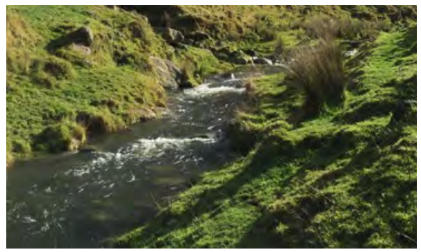
Rivers, streams, burns and creeks – continually or intermittently flowing bodies of freshwater.

Broad definitions of the different types of waterways you may come across are outlined below. See glossary for specific definitions. Different types of waterways have different indicators of ecosystem health. It is useful to understand the different types of waterways you have on your property so that you can ensure you are managing them effectively.