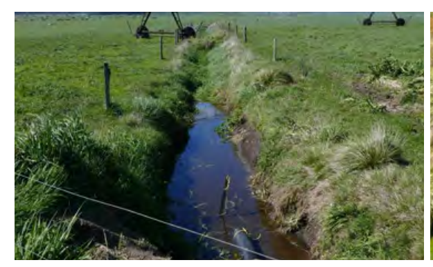
Artificial watercourse (e.g. ditches, drains, water race) – human-made or modified waterway with continually or intermittently flowing water.