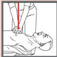
Firmly push down five centimetres on the chest 30 times