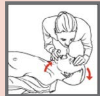
Give two breaths. Continue with 30 pumps and two breaths until help arrives