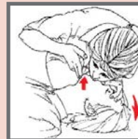
BLOW Tilt chin Lift head Check breathing