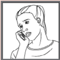
CALL Dial 111