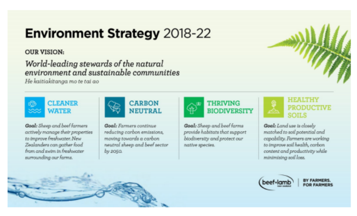
Figure 1: B+LNZ's Environment Strategy Pillars