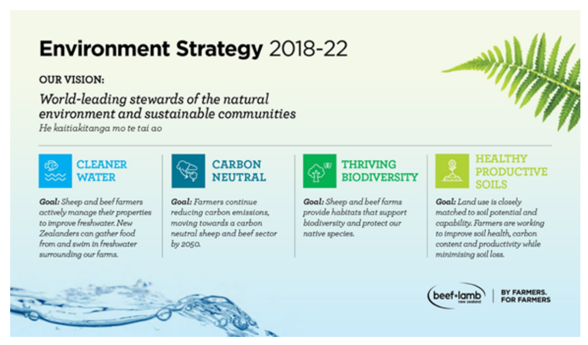
Figure 1: B+LNZ's Environment Strategy Pillars