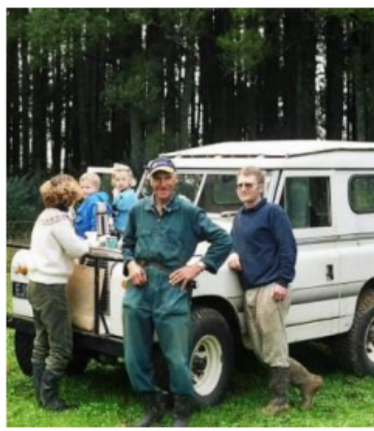
....And the best thing after a hard day fencing off a kahikatea stand – the cup of tea and homemade scones afterwards...